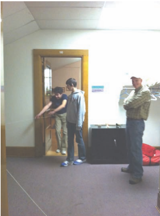
Confirmation Class's Trust Walk